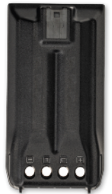
3000mAh BATTERY 2