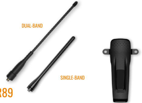
R89 ANTENNA FOR SINGLE-BAND & DUAL-BAND MODELS