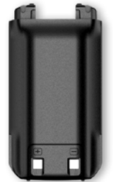
2200mAh BATTERY 1